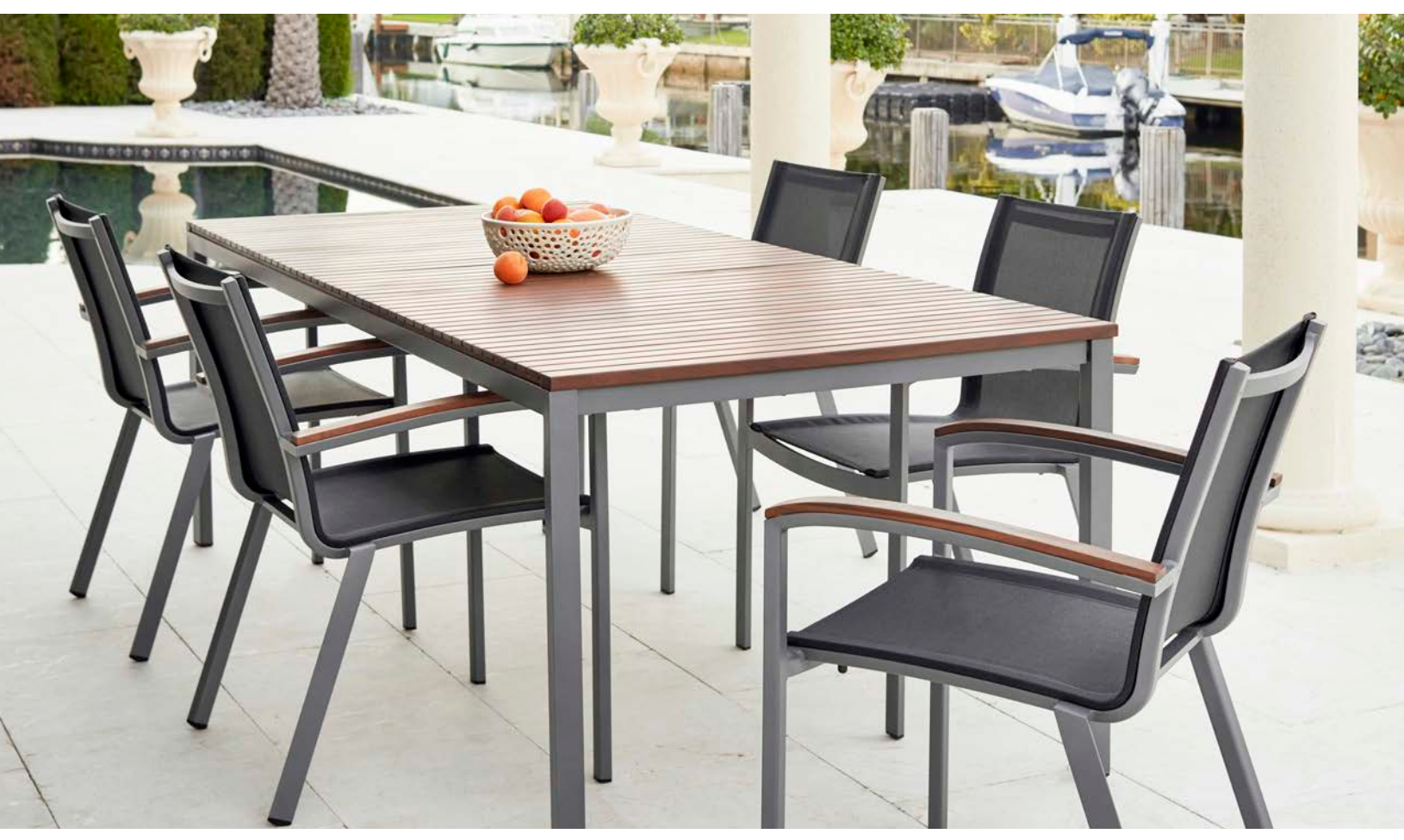
HARMONY-STACKING SLING ARM CHAIR 23001 86" RECTANGULAR DINING TABLE WITH IPE TOP 23250