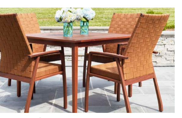
Eflex Arm Chair Bronze-Sunbrella® Elastic Strap