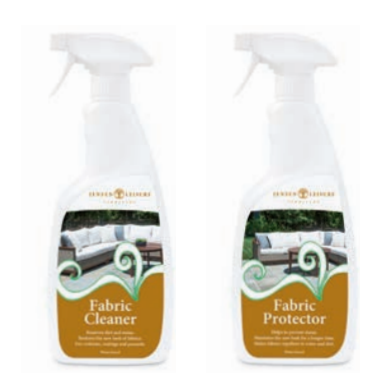
Fabric Cleaner 81060, Fabric Protector 81070