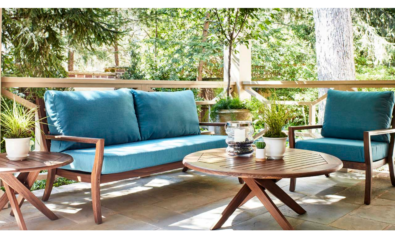
LAGUNA-LOVESEAT 66410, LOUNGE CHAIR 66400 TOPAZ-SIDE TABLE 66700, ROUND COFFEE TABLE 64700