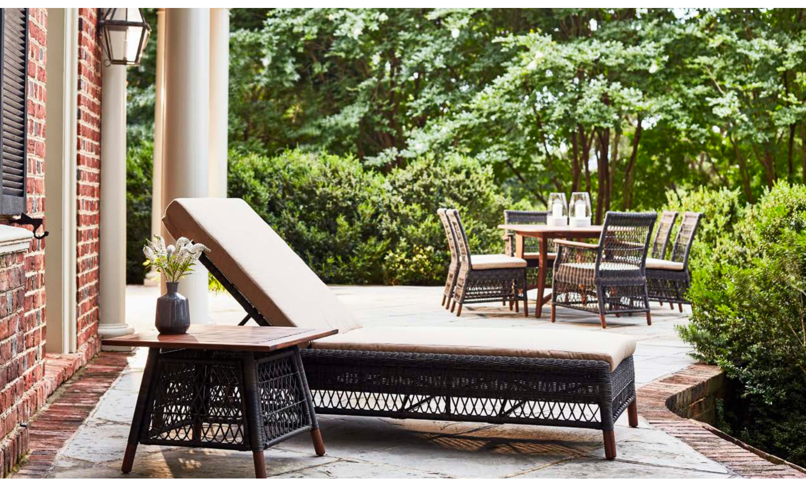
VINTAGE-CHAISE 52450, SIDE TABLE 52700, ARM CHAIR 52000 TOPAZ-65"-87" OVAL EXTENSION TABLE 64220