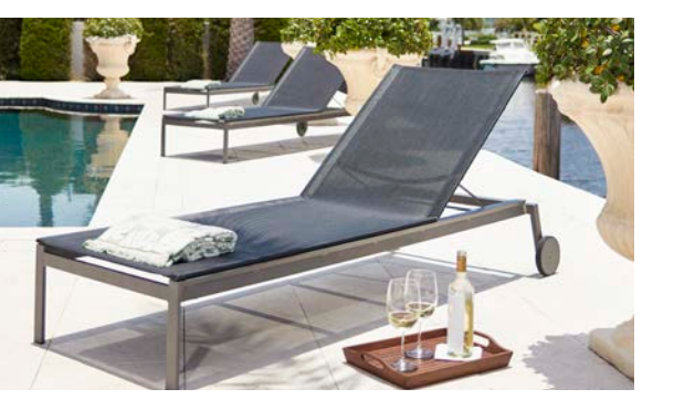
Harmony-Sling Chaise 23451

How to keep your woven fiber, sling, strap, and cushion fabric in top condition.