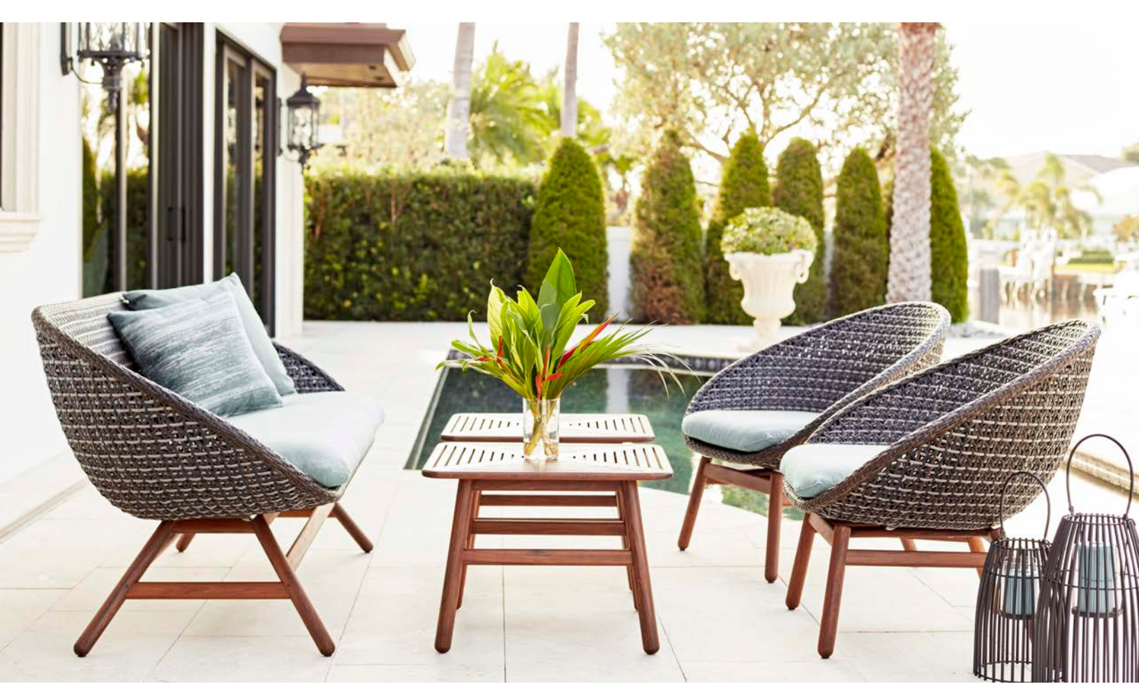
NEST-LOUNGE CHAIR 22401, LOVESEAT 22420 SQUARE SIDE TABLE 22700