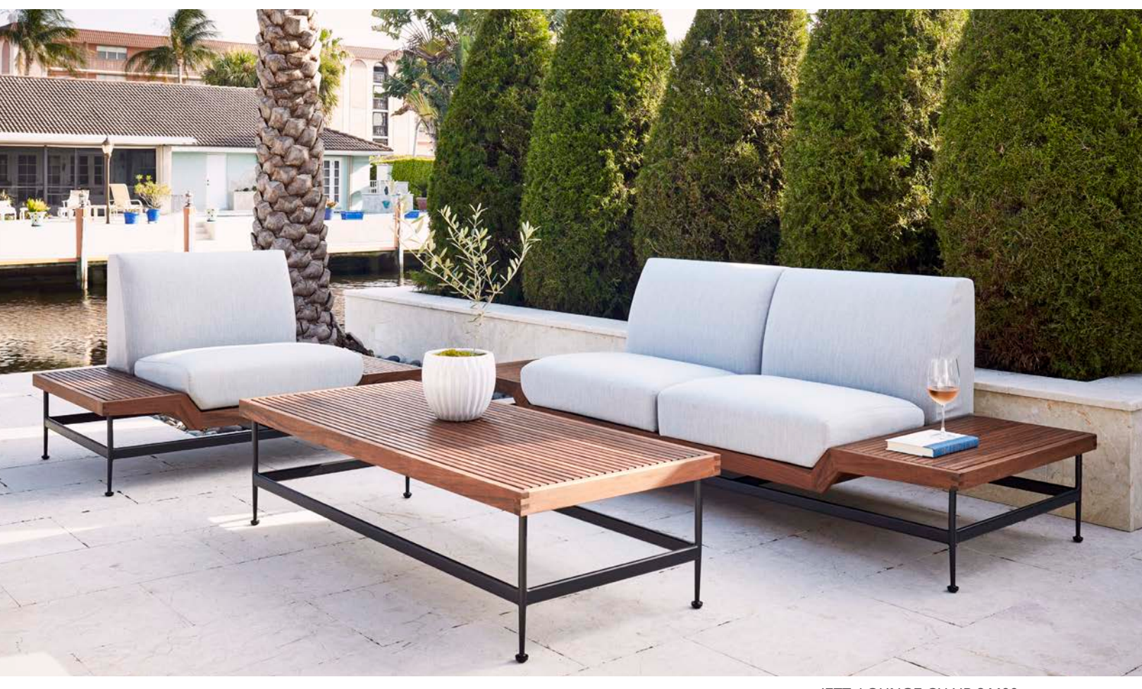
JETT-LOUNGE CHAIR 24400 LOVESEAT 24420, COFFEE TABLE 24700