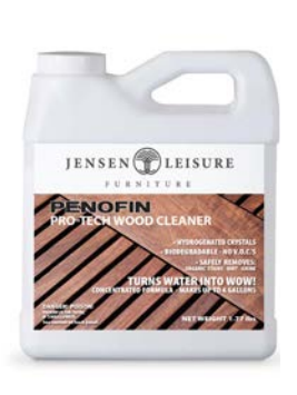
Pictured From Left-Ipe Aftercare Kit 81000, Wood Shield 81040, Wood Cleaner 81030