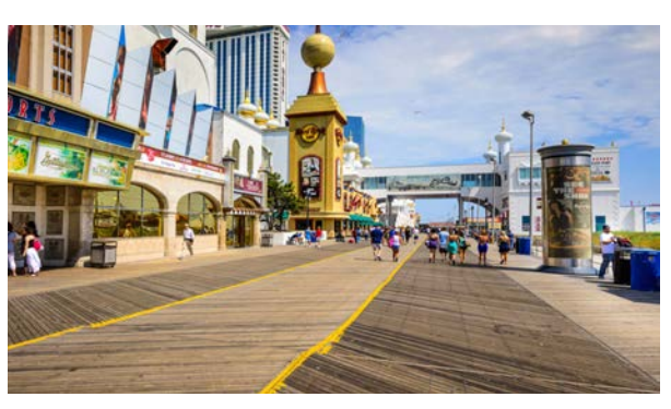
Atlantic City Boardwalk