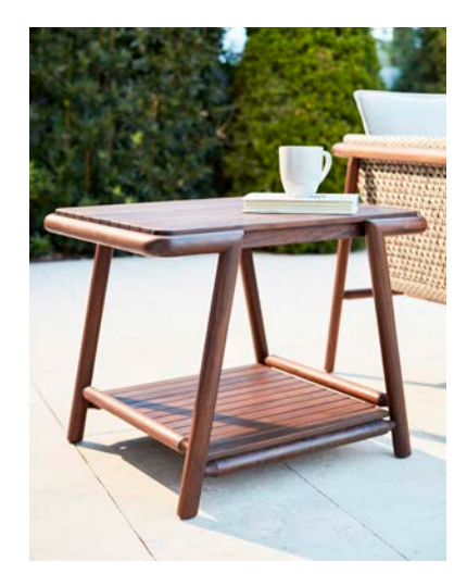
FORTE SIDE TABLE