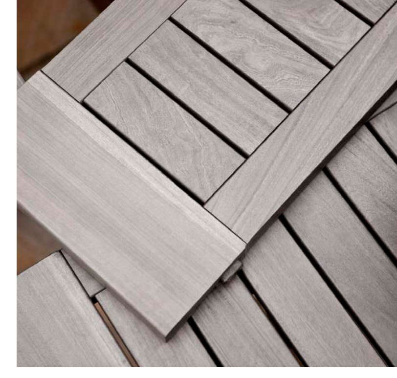
Ipe Aged to a Silver Patina

Although Ipe is naturally stable, small checks in the surface (minuscule openings of the wood grain at the ends) may appear if the furniture is placed in a very dry or sunny environment. Superficial checking in no way affects the structural integrity and longevity of the furniture and will in fact disappear when the environment becomes moist. In full sun, Ipe will naturally weather to an elegant silver patina.