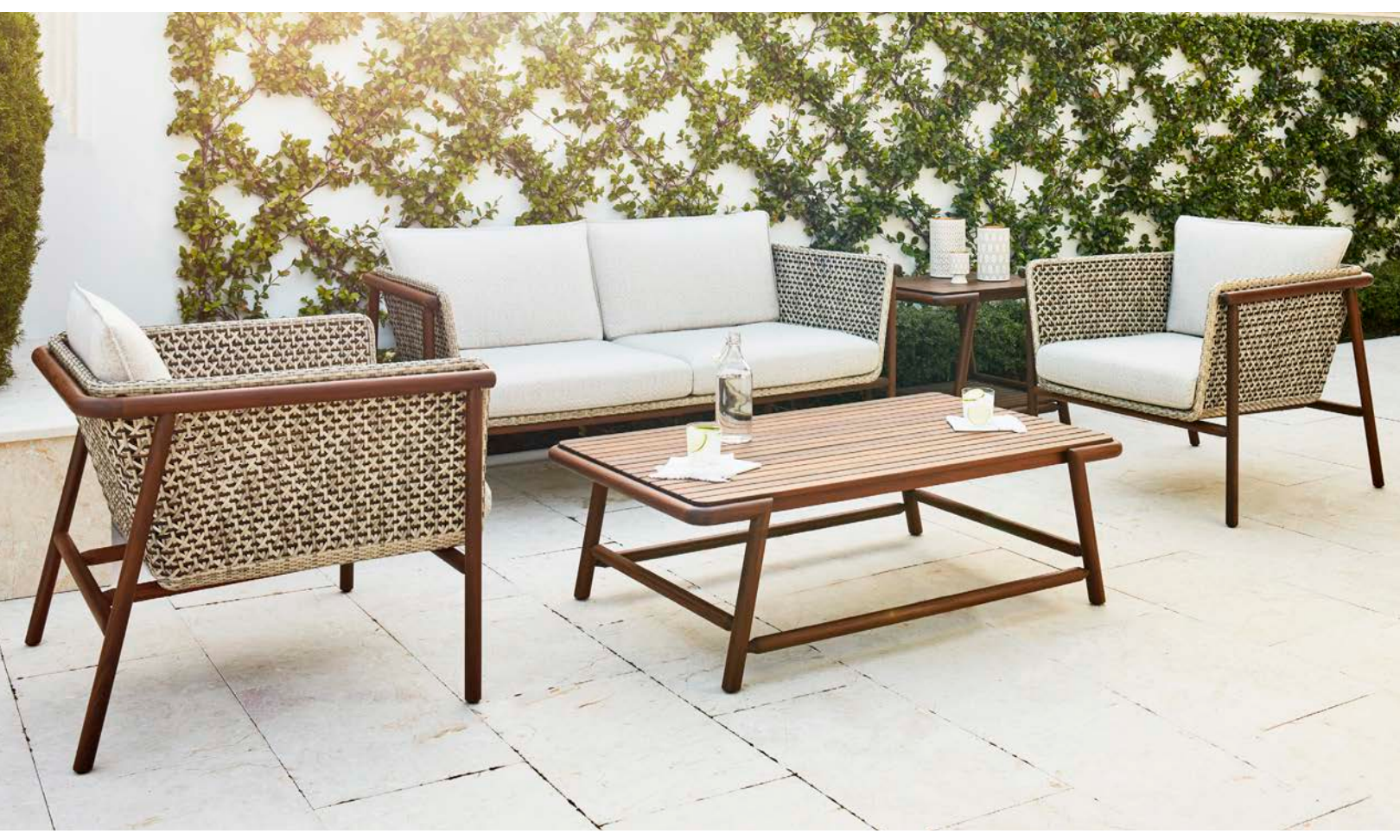
FORTE-LOUNGE CHAIR 68400, LOVESEAT 68420 COFFEE TABLE 68710, SIDE TABLE 68720