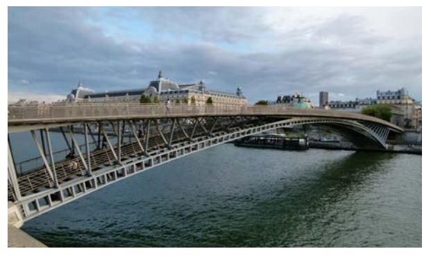
Paris Soferino Bridge