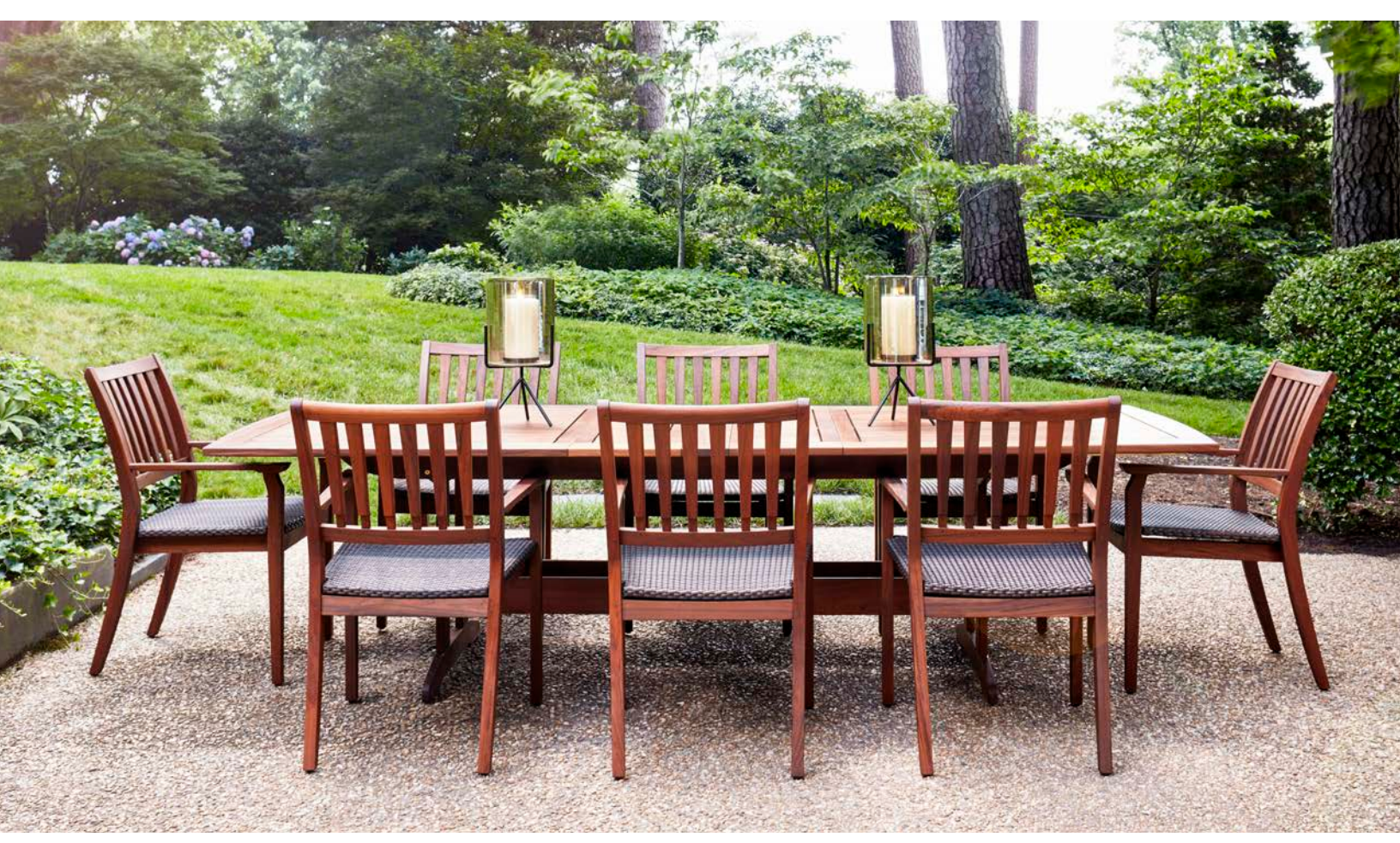
UNICON-ARM CHAIR 21000 RICHMOND-85" TABLE 65250, 24" EXTENSION 65260