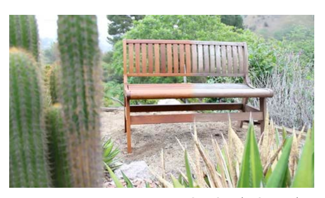
Ipe Care Step-by-Step Video: jensenleisurefurniture.com/maintenance-and-care/